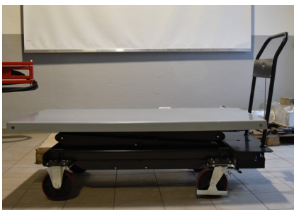
Compact and stable

The lifting table is equipped with spring-loaded safety system and has a 1000 kg load limit.