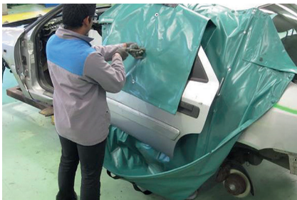
Easy to use blanket