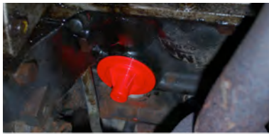
Oil Filter Cap

The closing plugs are especially suitable for sealing the bore hole on the tank or on the gearbox.