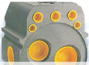
Tank Sealing Plugs