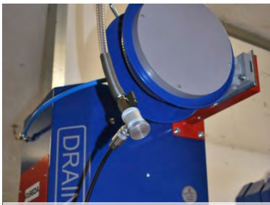
Suction Lance - hose reel

An intelligent solution for a safe and tight seal for removed oil filters.