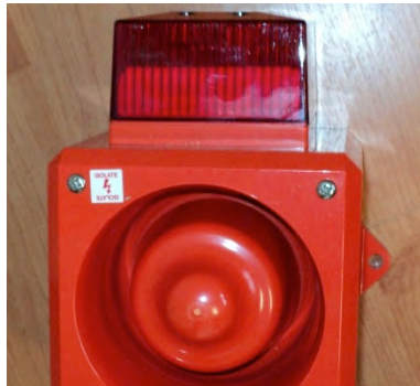
Optional: Alarm module