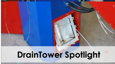
Drain Tower Spotlight

Complete suction of the windscreen wiper fluid.