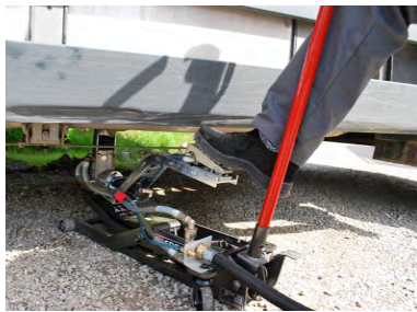
... and simple drilling