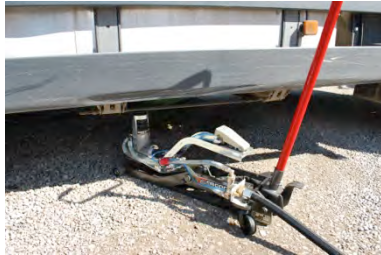
Easy fixing at the tank ...