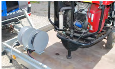
Fix-mounted hose reels