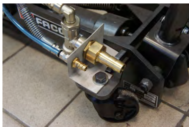
Hose connections with quick release

The vehicle must not be raised, thus the mobile tank drill can be used anywhere without any trouble.