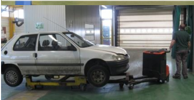
Alternative to a forklift