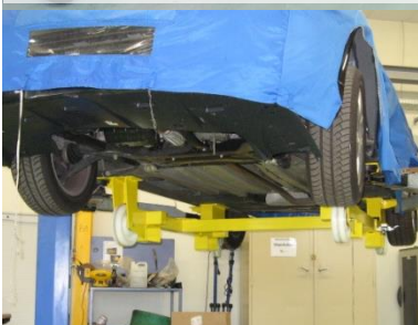
Single Lifting Ramp