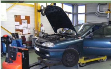
Electric Pallet Truck