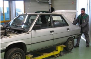
Easy to navigate

Once placed on the trolley a forklift is no longer needed to move a vehicle around the working area. The robust construction, with four sturdy wheels (incl. wheel-lock) as well as the optimal size, that fits with almost all common cars, show the advantages of the SEDA VehicleTrolley.