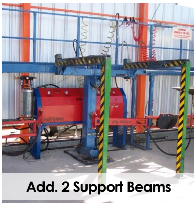
Add. 2 Support Beams

The fork distance is adjustable enabling easy fit for varying vehicle makes and models.