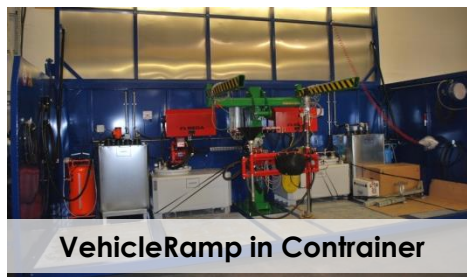
VehicleRamp in Contrainer