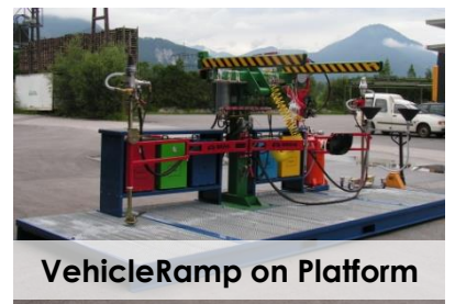
VehicleRamp on Platform