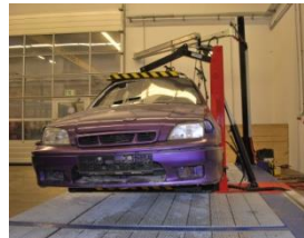
Step 2: Secure the car