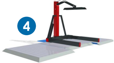
Available with catchment area