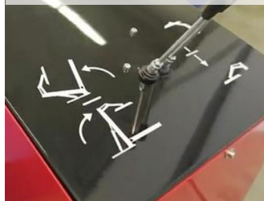
Simple operating system