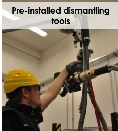
Pre-installed dismantling tools