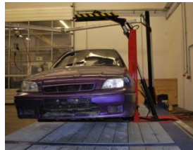
Step 1: Place the car

„View online demo video on our website: www.seda.at “