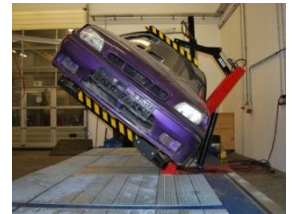
Step 3: Turn the car