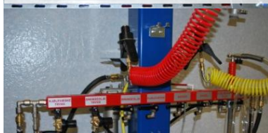
Easy control panel