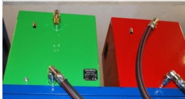
Separate pumps on top