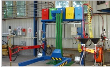
With single lifting ramp