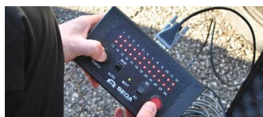
Compatible with SEDA AirbagMaster