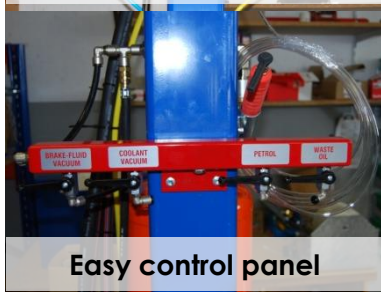
Easy control panel