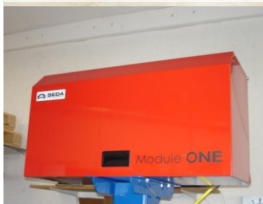
Special pump housing