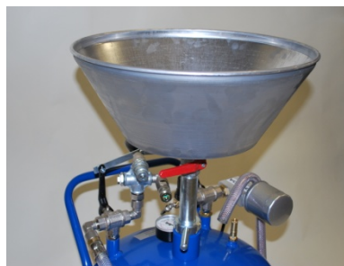
Collecting funnel for oil