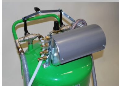
Activated carbon filter