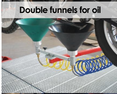
Double funnels for oil