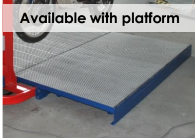
Available with platform