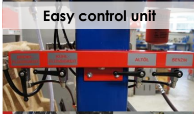
Easy control unit