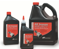
All Season Select