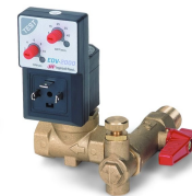
Electronic Drain Valves