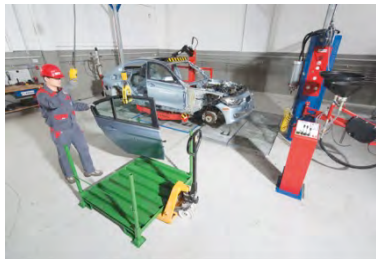
... and dismantling at the same place!